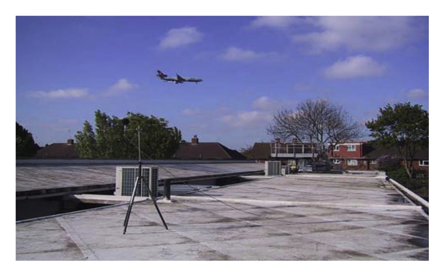
Fig. 2. Aircraft noise assessment at a UK primary school in the RANCH project.

Data was collected from March to May 2008, during a 45 min lesson. Written consent was obtained from the head teacher. Parents and participants received an information letter about the study one week prior to data collection; passive consent was obtained from parents who could opt their child out of the study. Written consent was obtained from the participant on the day of the study, after giving a further verbal explanation of the study and an opportunity to answer questions.