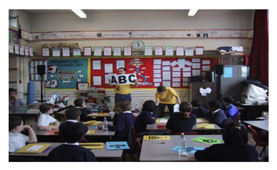
Fig. 1. Cognitive testing in the classroom at a UK primary school in the RANCH project.

exposure estimates were available due to lack of resources for the measurements.